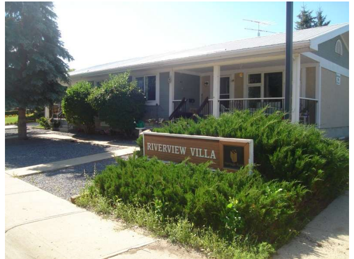
Riverview Villa 685 Riverside Drive Drumheller, AB T0J 0Y5