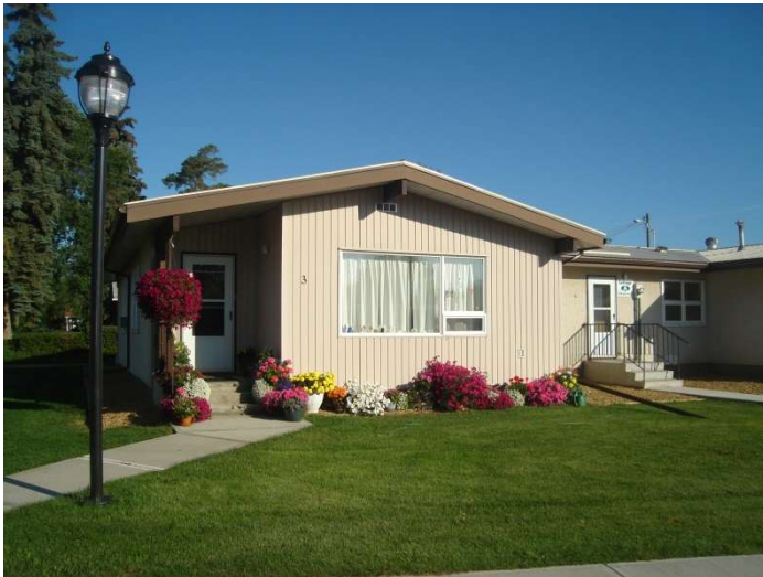
Cottages 698 – 6 Ave East Drumheller, AB T0J 0Y5