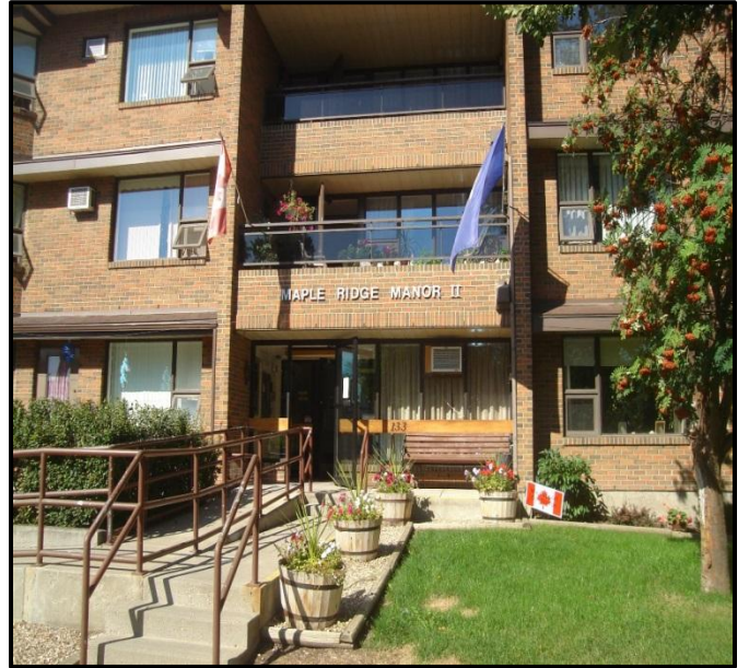
Manor II 133 Centre Street Drumheller, AB T0J 0Y4