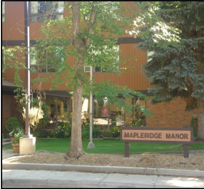
Manor I 250 - 2 Street East Drumheller, AB T0J 0Y4